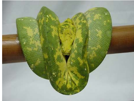
Male ID# 99017 Indonesian Import, Biak Locality