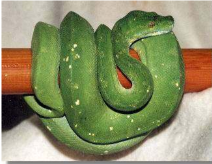
Female ID# 96011 Indonesian Import, Biak Locality