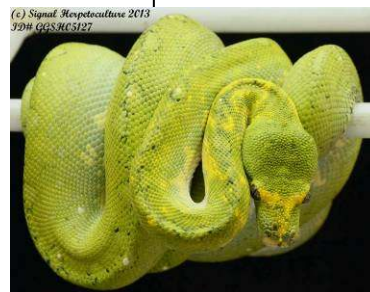
Male ID# GG(SH)05127 CBB 29 August 2005

12034—12050 Hatched 24 June 2012 Artificial incubation, 6 yellow & 10 maroon