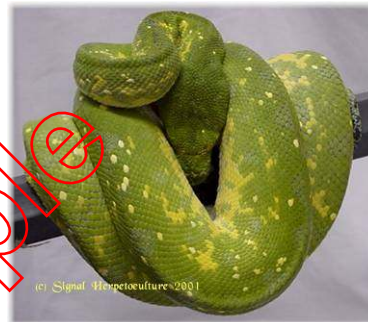
Female ID# 99018 Biak form Indonesian Import